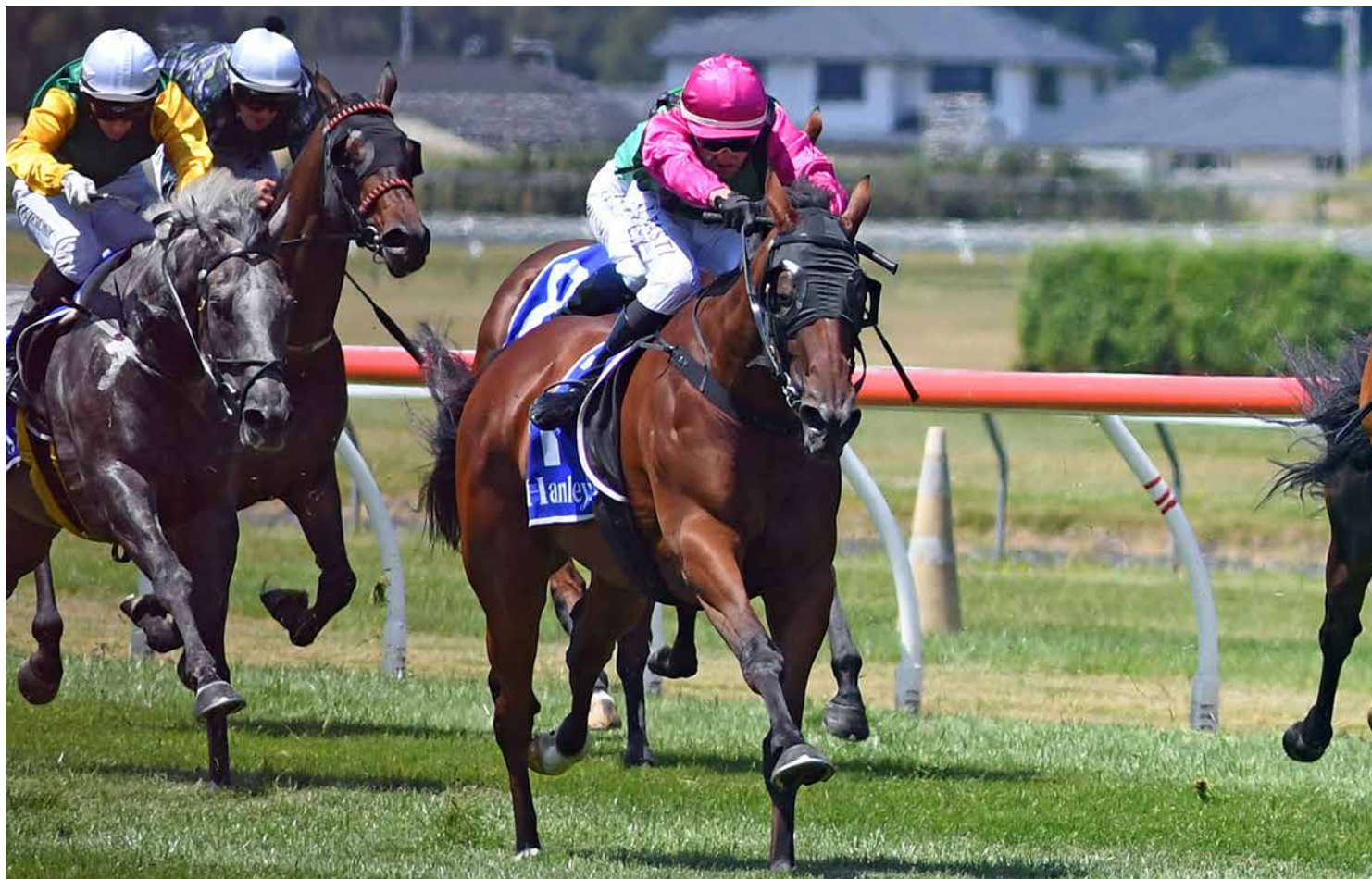
Pukekohe visitor Super Strike wins the Gr.3 Wellington Seamarket Anniversary Handicap (1600m) at Trentham

S ix decades on from the heyday of the legendary sprinter Yahabeebe, the same colours have played a starring role at Trentham.