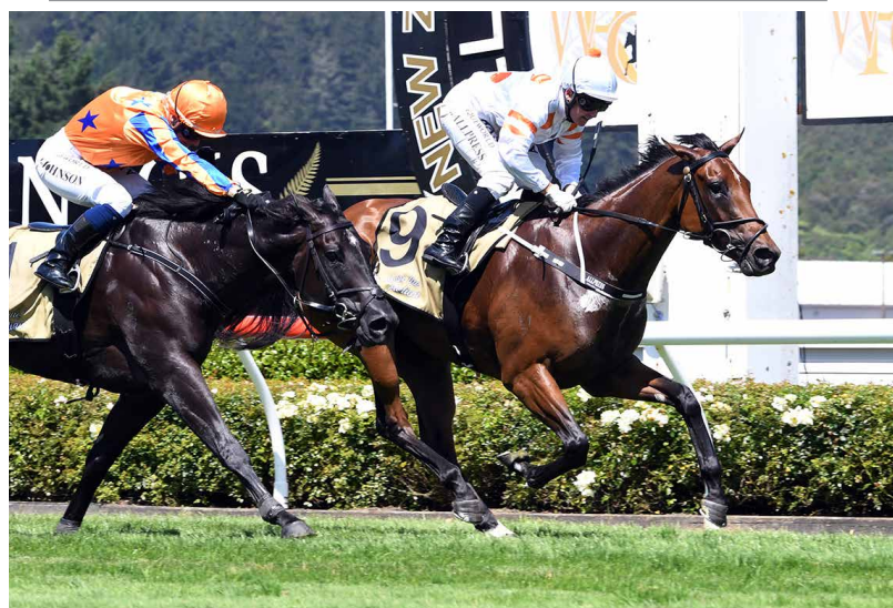
Bonham (inner) holds out a late charge from Brando to win the Gr.1 Devan Plastics Levin Classic (1600m)