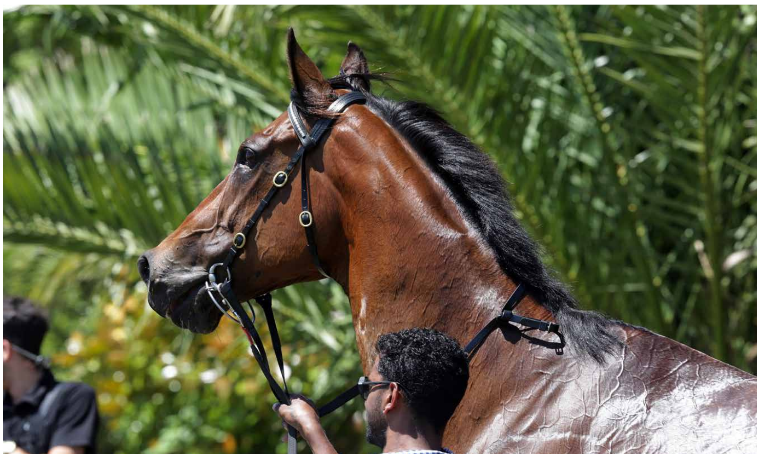
Julius heads back to the stalls after winning the Gr.3 J Swap Contractors Sprint.