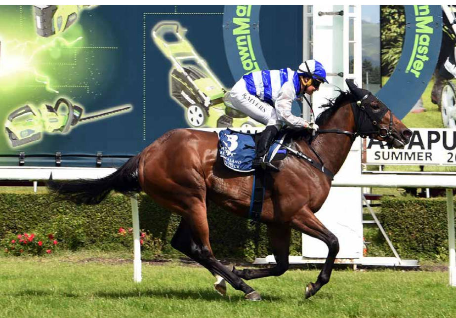
Lilikoi is out on her own as she races to victory at Awapuni.