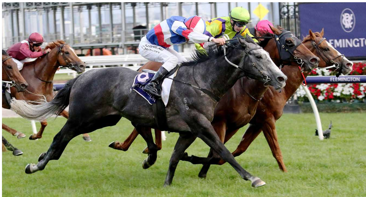
Bumper Blast (grey) digs deep to get the win at Flemington. (Colin Bull)