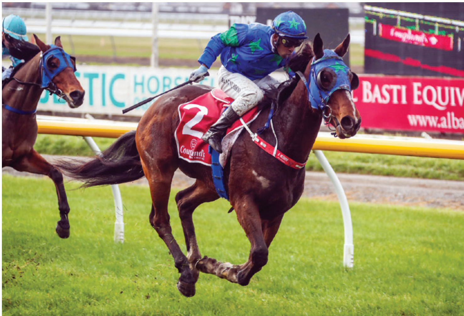
Rohan Mudhoo guides Frankie The Fox to victory at Riccarton