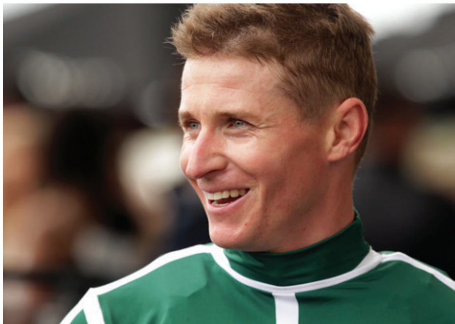
Champion jockey James McDonald

"He does a great job communicating with everyone and we work really well together.