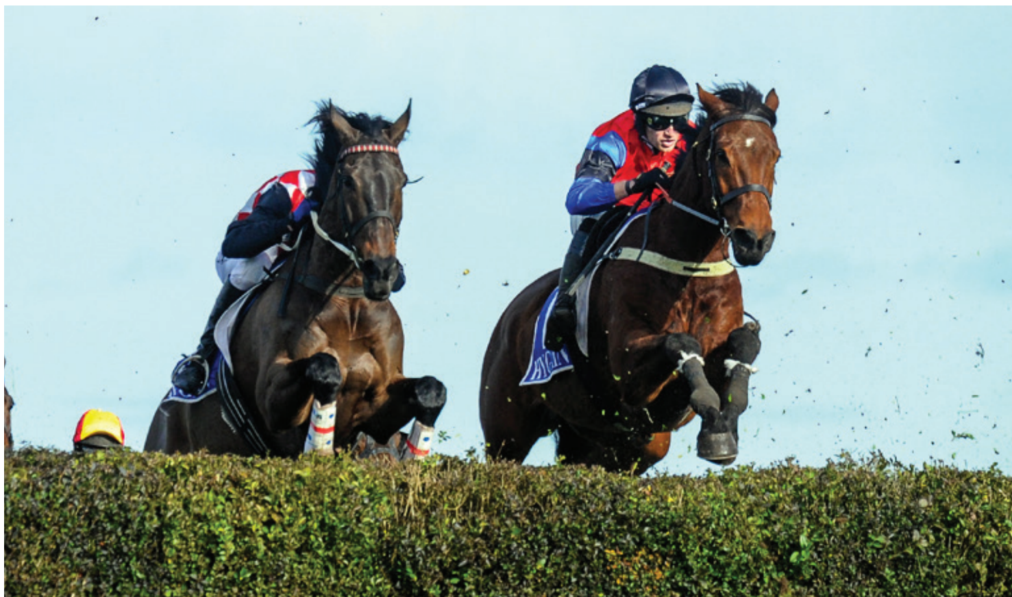
Shamal (right) flies a fence on his way to victory at Casterton

Leading Kiwi jumper Shamal (NZ) (Zabeel) took the next step on his path to the Australian Grand National Steeplechase (4500m) at Ballarat in August with a gritty victory at Casterton on Saturday.