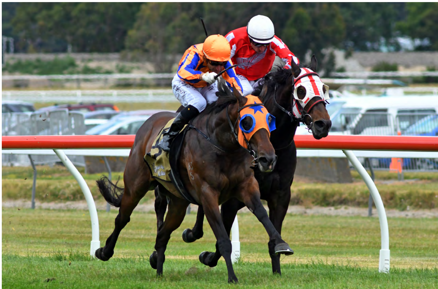
Enzo's Lad (inner) and eventual winner Avantage battle out the finish of the Gr.1 JR & N Berkett Telegraph (1200m) at Trentham