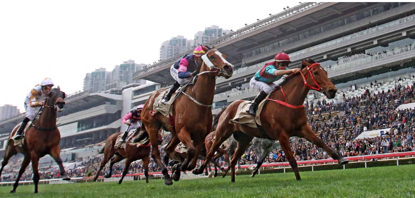
Beat The Clock (outer) defeats Thanks Forever at Sha Tin (HKJC)

Beat The Clock (Hinchinbrook) displayed the class that has made him a champion to complete back-to-back wins in the HK$10 million Gr.1 Centenary Sprint Cup (1200m) at Sha Tin on Sunday.