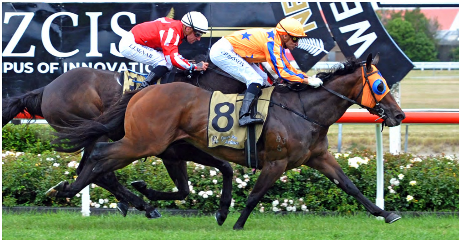
Avantage takes out her second Group One title with a victory in Saturday's JR & N Berkett Telegraph (1200m)