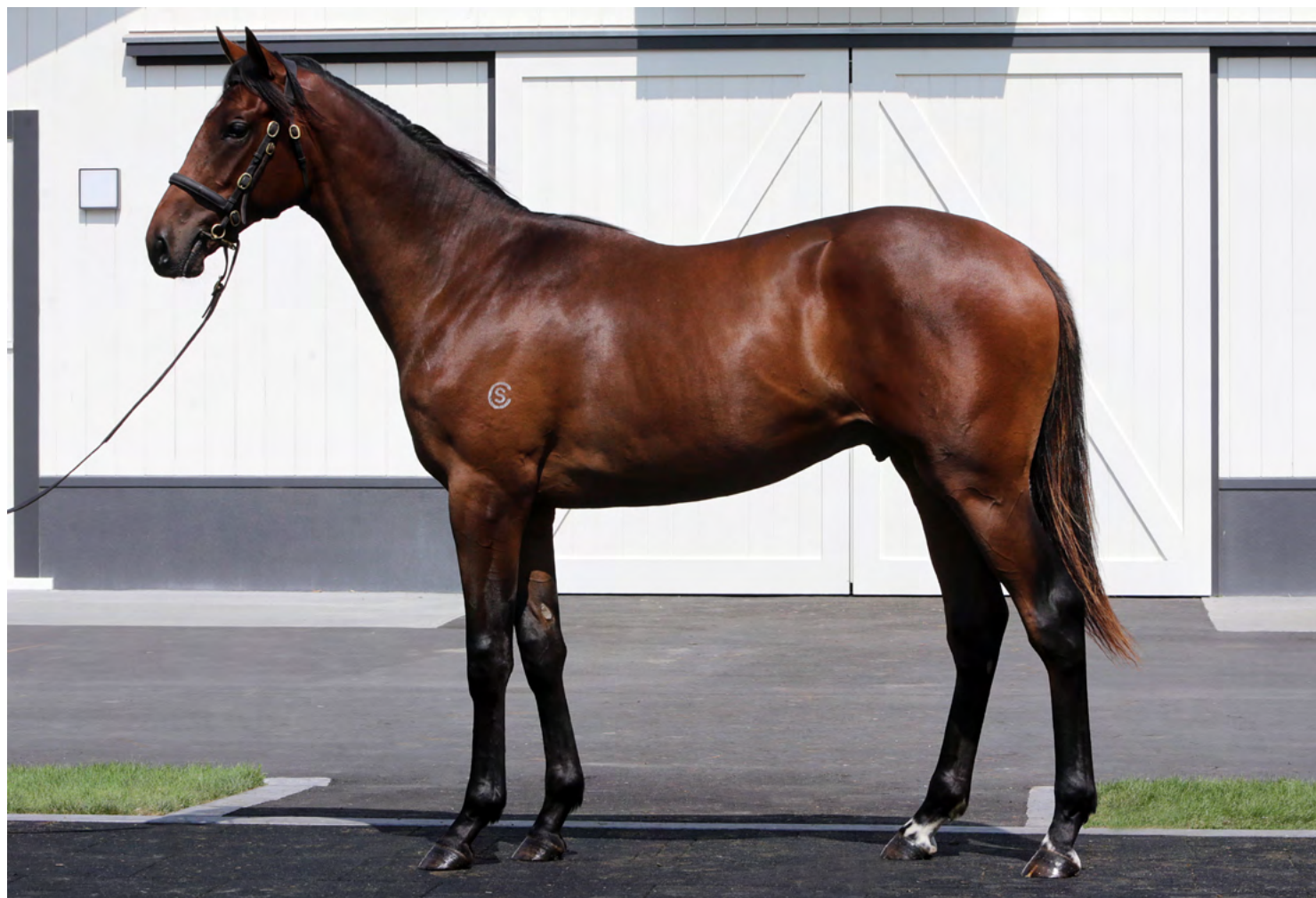
Lot 417 the Tavistock ex Zonza colt, a half-brother to classy filly Bavella from the Cambridge Stud draft at the upcoming 2020 National Yearling Sale at Karaka (Trish Dunell)