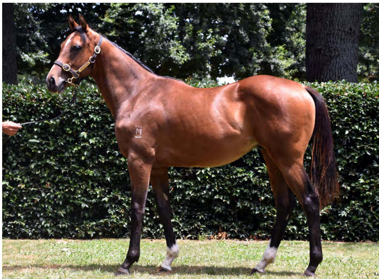
Lot 352 the Contributor ex Thunderchine colt from the Mapperley Stud 2020 National Yearling Sale consignment