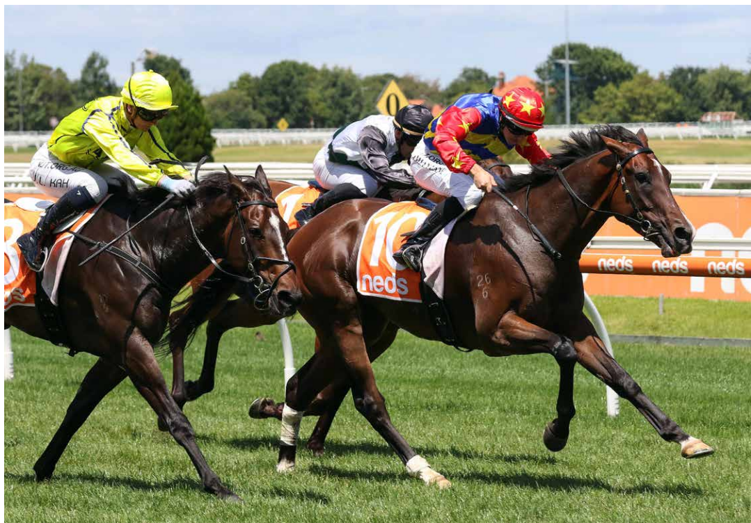
War Critic winning at Caulfield on Saturday.