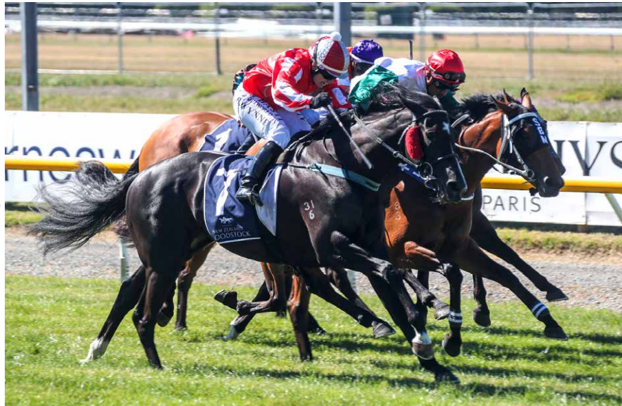
All About Magic gets the better of Belle Fascino to take out the Listed Speight's Timaru Stakes (1400m) at Riccarton

"Today she dropped to just 53kgs and just didn't know herself.