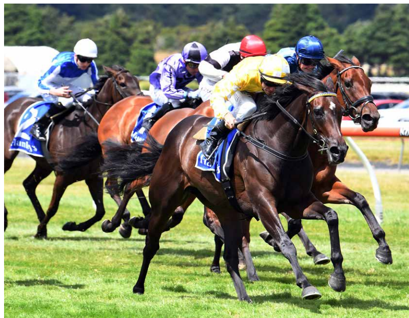
Lightly raced filly Force of Will takes out the Gr.3 New Zealand Bloodstock Desert Gold Stakes (1600m) at Trentham