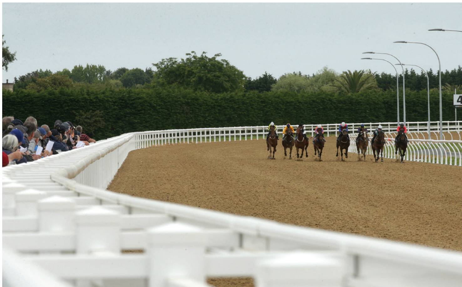
The Cambridge Jockey Club is preparing to hold the first racemeeting on its new synthetic track on Wednesday (Trish Dunell)