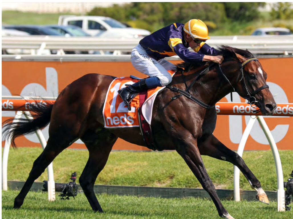
Alabama Express winning the Gr.1 CF Orr Stakes (1400m) (Bruno Cannatelli)