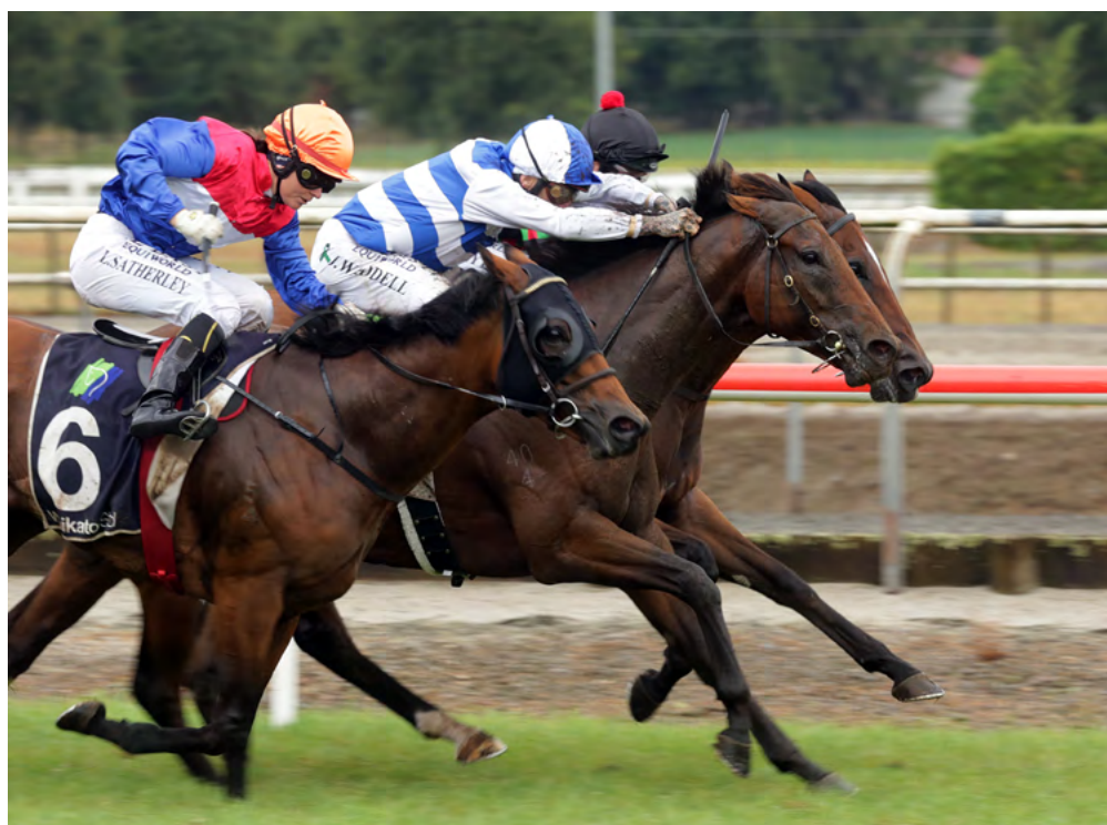
Talented racemare Supera (middle) squeezes through a gap on her way to victory at Matamata