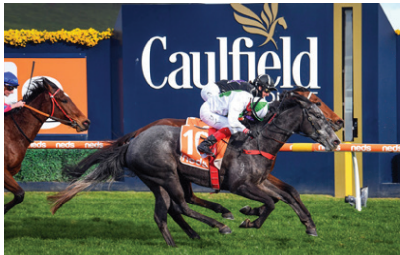
Cru Classe works hard to get the win at Caulfield.

The son of Sacred Falls had a length and three quarters margin on the line from Ashford Street (Moshe) ($15), a benchmark 58 handicap winner at Casterton earlier in the week, who nosed out The Garden (Shooting To Win) ($4.20 favourite) for second.