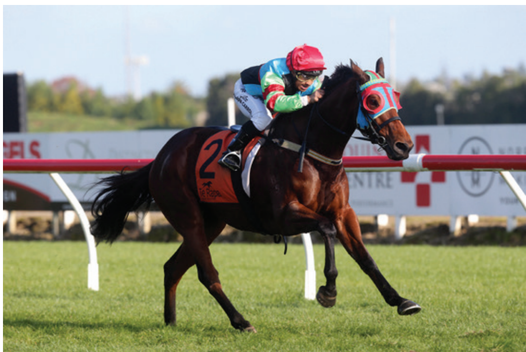
Crystallize and Ace-Lawson Carroll are well clear as they approach the winning post at Te Rapa