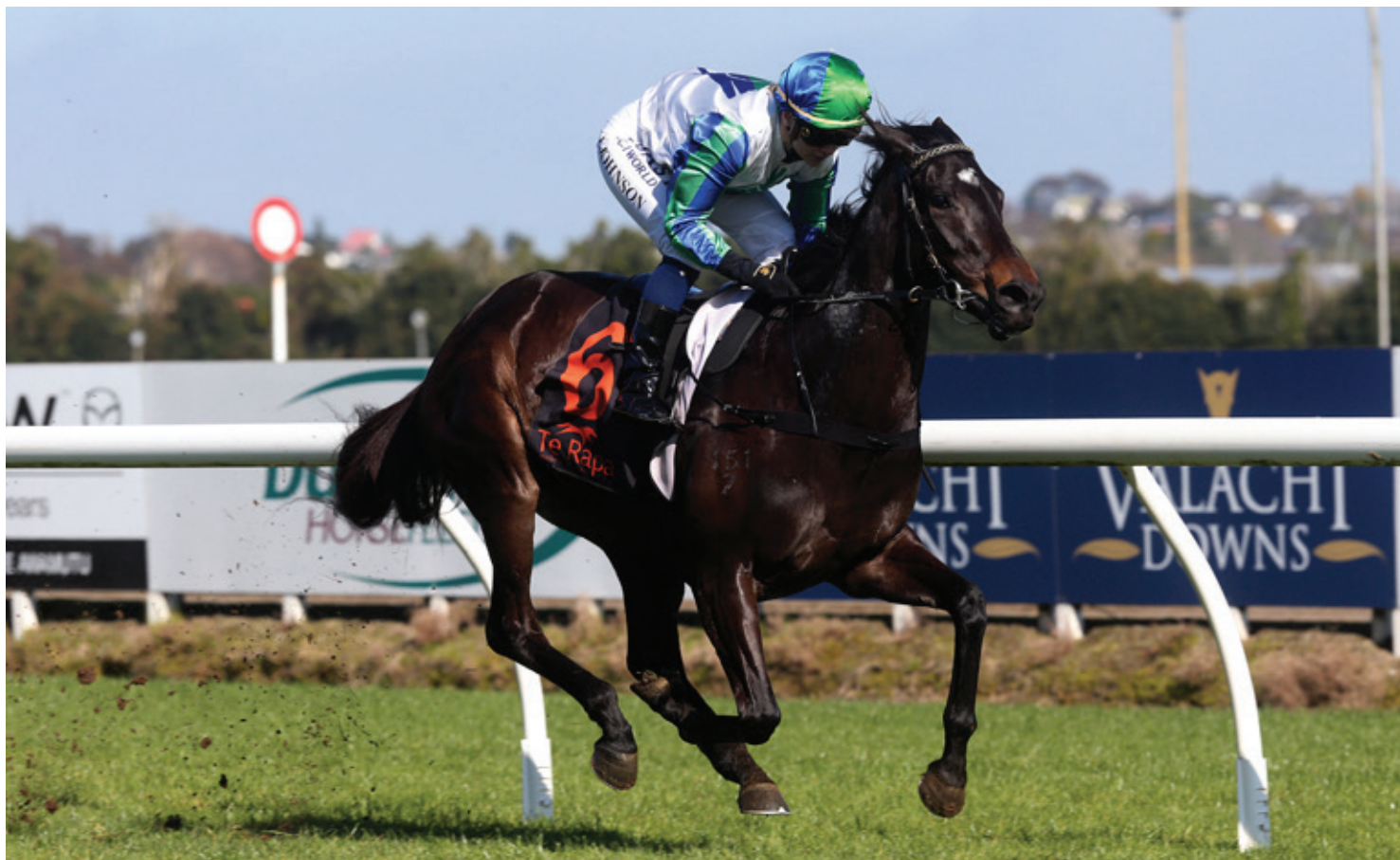
It Might Be You strides to her maiden victory at Te Rapa

D ebutante It Might Be You (NZ) (Savabeel) looked to have a bright future ahead of her as she easily won a maiden 1200m event at Te Rapa on Saturday.