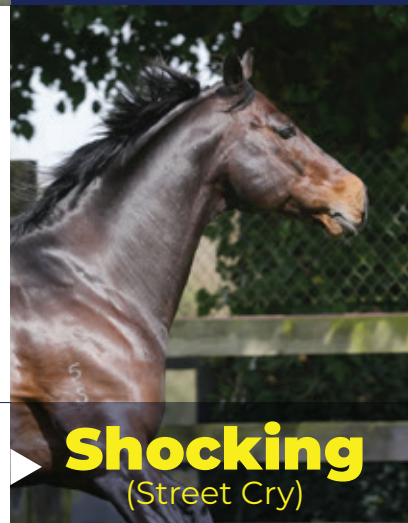
Shocking (Street Cry)