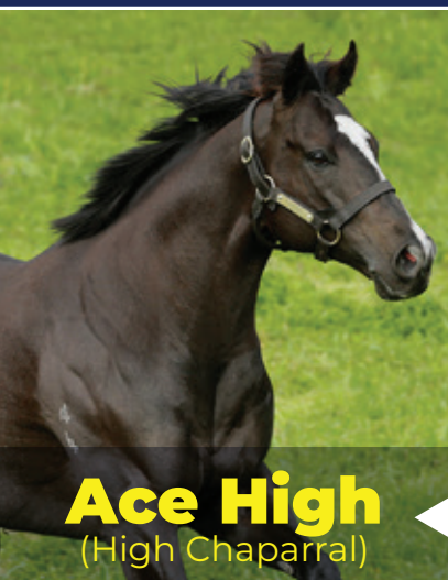
Ace High (High Chaparral)

Leading First Season Sire @2021 Weanling Sale