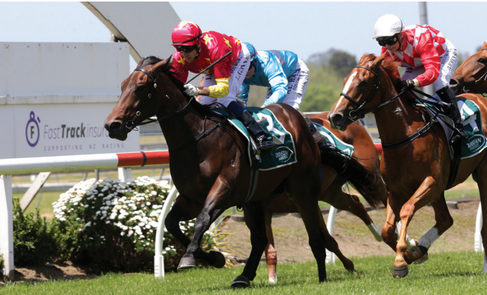
Promising galloper Unition pictured winning on debut at Pukekohe last year