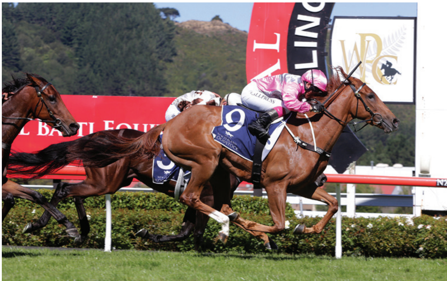
Gr.2 Wellington Guineas (1600m) winner Gold Bracelet will do her future racing in Australia (Trish Dunell)