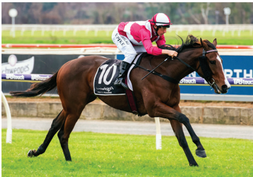
Showmanship makes it three wins from four starts as he bolts home at Belmont