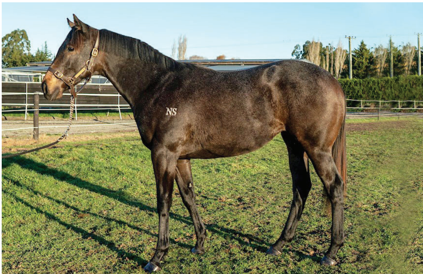
The Reliable Man – Lady Zafira filly (pictured) was the top-priced lot at New Zealand Bloodstock's annual South Island Sale

"The vendors did a really good job with their line-up of horses," said Cataldo.