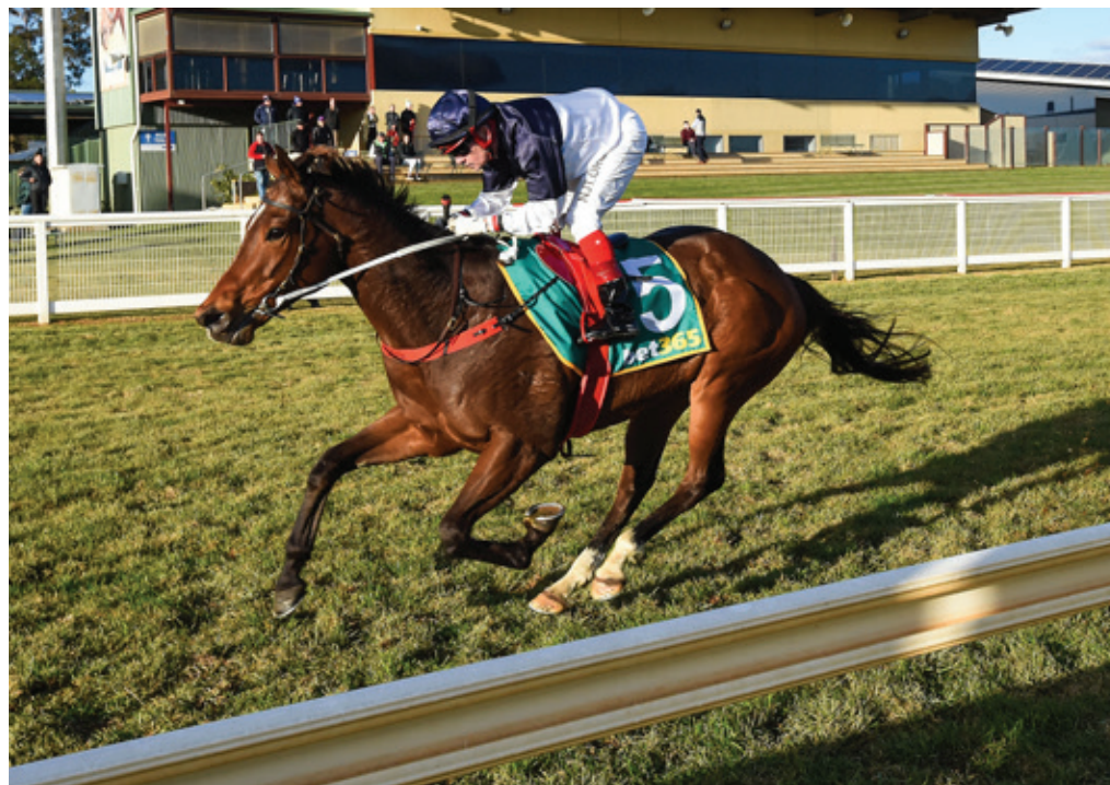
Heptagon cruises to a comfortable victory in the Swan Hill Cup (1600m)