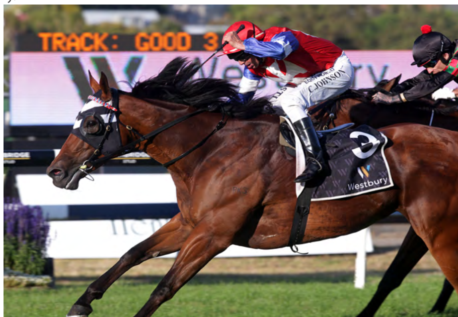
Southern mare Kiwi Ida produces a classy effort to win the Gr.2 Westbury Classic (1400m) (Trish Dunell)