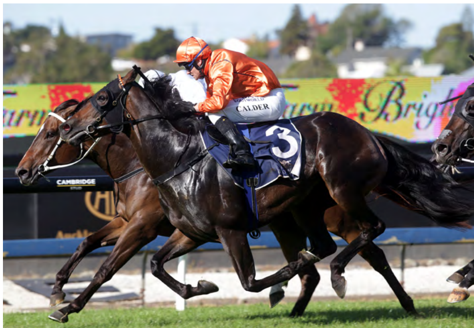
Its Destinys Child levels up to Molto Veloce (inner) to take out the Gr.3 Preferment@Brighthill Farm Concorde Handicap (1200m)